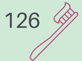
Personal Grooming Supplies