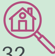
Housing Search and Information