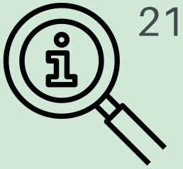
Information and referrals