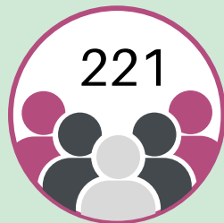
Monday Night Group